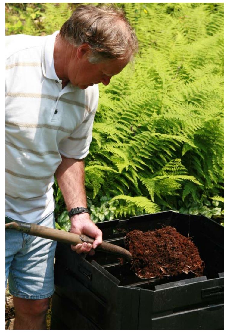
Composting creates great organic fertilizer and reduces your waste

Once you know where you'll be planting your garden and have nice, healthy soil, it's time to get to the fun part—actually planting! You can either get a head start and plant the garden from scratch—plant seeds in a tray and keep them in a sunny warm spot indoors until the threat of the last frost is over, then transplant them outside or in their respective containers— or you can wait and just plant seeds directly in the ground. Warning: While it is fine to plant seeds directly in the ground for your garden, be cautious of critters, like squirrels and birds, who like to dig up the seeds for a tasty treat. You can repel these by planting visual bird and animal scare devices. These can be found at your local gardening sup-