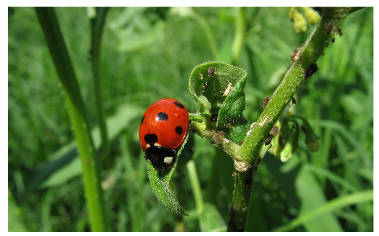
Beneficial insects provide a natural source of pest control. Photo of ladybug eating aphids by Greyson Orlando.

■ Monitor Problems. To keep ahead of pest problems, become a good sleuth! Carefully examine each area for signs of weeds, brown spots, and leaf damage, such as wilting, curling, or holes. If you detect a problem, use a hand lens and examine the affected plant. Expect to see a variety of insects, but if any seem particularly abundant, then collect and identify samples as these may be your culprits. Keep records of your monitoring results so that you will be able to learn how to predict pest outbreaks to prevent damage. With time, you will be able to recognize problems