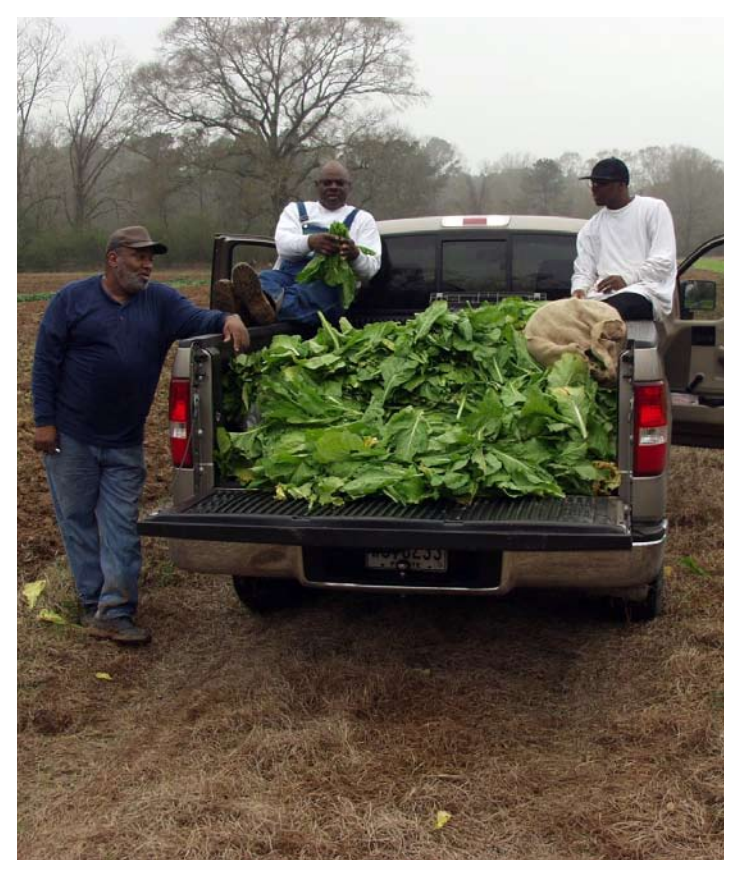
Farmers from Baton Rouge, Louisiana pack their truck with organic greens.

Our efforts at using risk assessment and the resulting risk mitigation measures should be declared a failed human experiment. Tinkering with additional margins of safety that allow unnecessary toxic materials (without an alternatives and essentiality assessment) on the market is playing with uncertainties that we can no longer afford to play with. Organic is the critical and viable alternative.