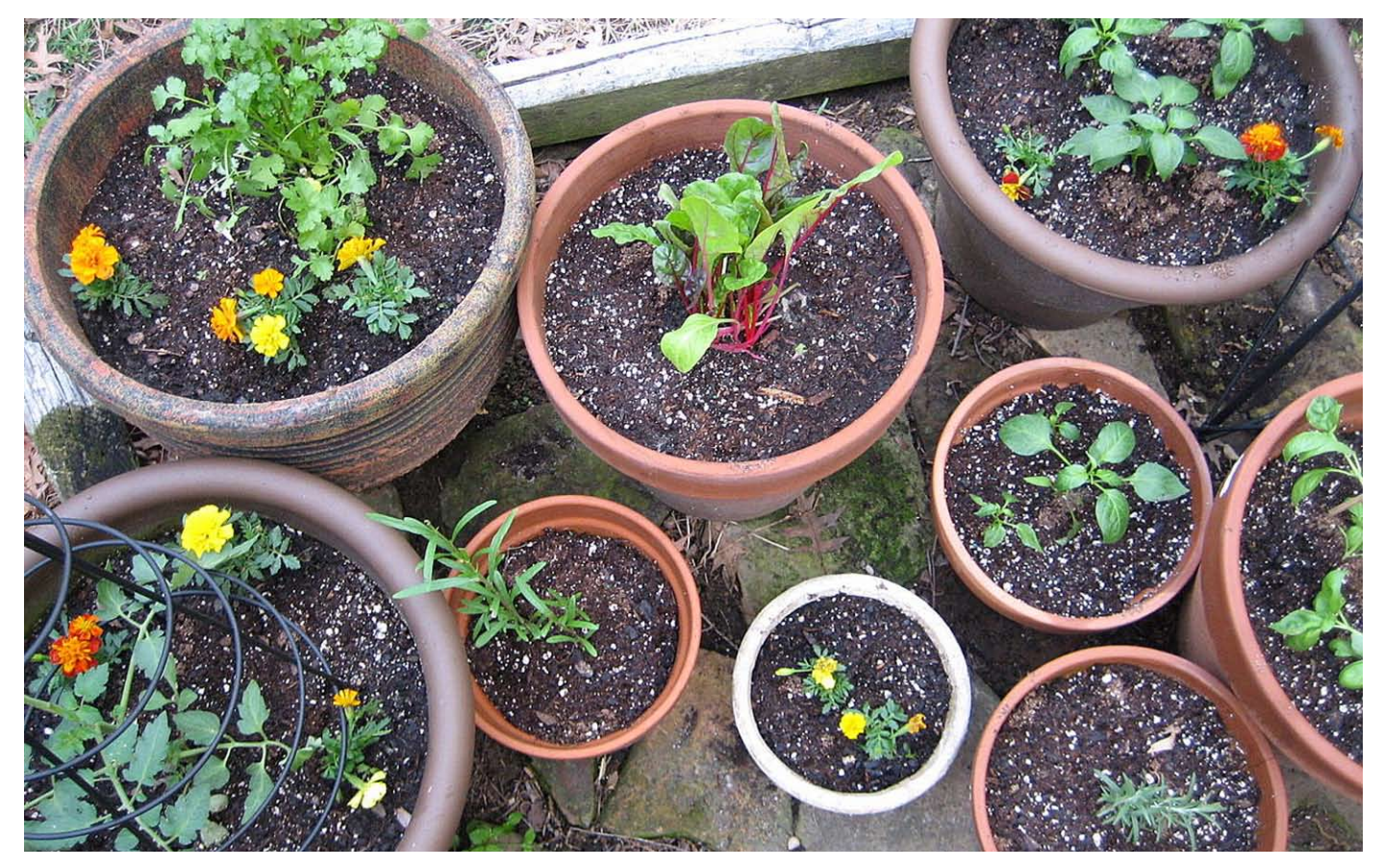
Container gardens are great in small spaces, when you don't have a yard or in areas of poor soil quality.

some don't allow the use of synthetic fertilizers or pesticides –be sure to ask about this before you decide to participate! This is a great option for people who don't have access to a yard, balcony, porch or windows with sufficient sunlight, like city dwellers living in a huge apartment complex. It's also great for people who want to get serious about harvesting their own food and want to produce more than what they are able to in the space they have, or just for people who want the joy of farming with friends.